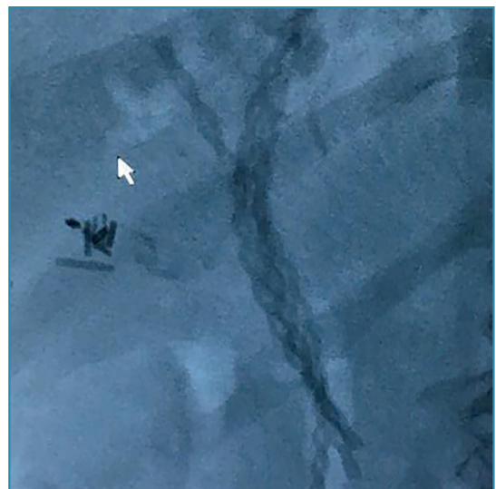
Image 2. Fluoroscopic view of the three (3) ARCHIMEDES stents placed in the CBD.