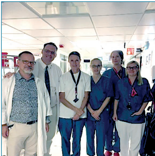
Image 3. The entire team in Helsinki for the first placement of the ARCHIMEDES in Finland.