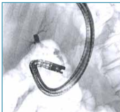
Image 3. Fluoroscopic view of CBD showing also some residual gallbladder sludge and small gallstones