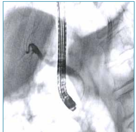
Image 1. Fluoroscopic image showing stenosis at the distal portion of the CBD.

ERCP performed to assess and remove plastic stent, attempt to eliminate small stones, and place bioresorbable stent. A 10 F standard plastic stent that had been placed previously was removed using endoscopic biopsy forceps. Additionally, several small stones and debris were removed from the CBD and in order to provide continued drainage and maintain patency, an ARCHIMEDES fully biodegradable biliary stent (10 F x 80 mm, slow degradation) was implanted in the CBD in transpapillary position.