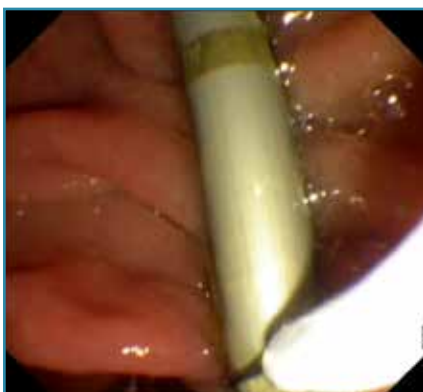
Image 2. Endoscopic retrieval of previously implanted standard plastic stent