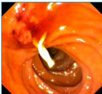
Image 6. ARCHIMEDES biodegradable biliary stent, clearly showing the duodenal flap