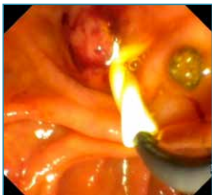
Image 5. Transpapillary introduction of the ARCHIMEDES biodegradable biliary stent

The technique for implantation was similar to the technique used for standard plastic stents making it easy for the physician and staff to adopt the new technology.