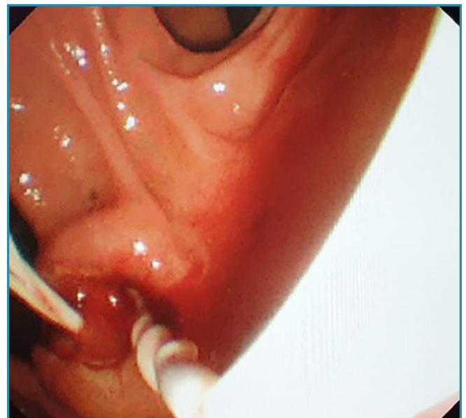
Image 2. Helical structure of the ARCHIMEDES stent can clearly be seen as the stent is inserted into the CBD.