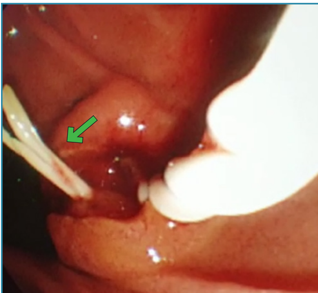
Image 1. Endoscopic view of the ARCHIMEDES biliary stent being placed into the CBD adjacent to the ARCHIMEDES pancreatic stent (green arrow).

Sphincterotomy was performed prior to cannulation of the distal bile duct and a guidewire inserted. A transpapillary fast degrading pancreatic stent (6 F x 60 mm) was placed in order to mitigate the possibility of post-ERCP pancreatitis (PEP).