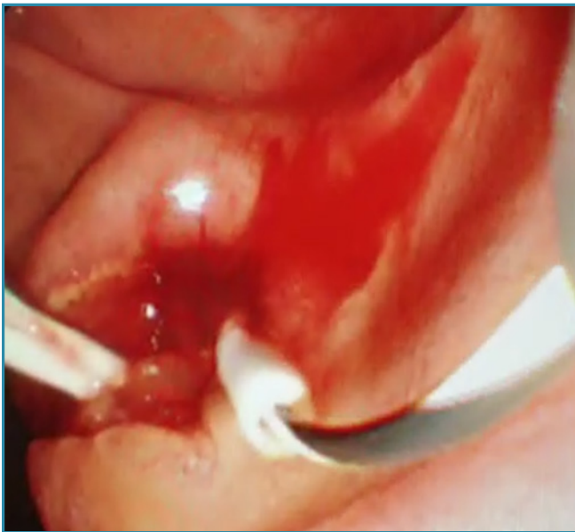
Image 3. Stent pusher being withdrawn after biliary stent has been placed into final position.

Both the ARCHIMEDES biliary and pancreatic stents were left with their distal most portions in the duodenum to facilitate with drainage and mitigate the effects of PEP (image 4).